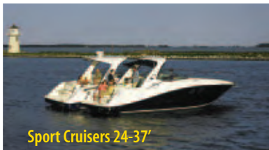
Sport Cruisers 24-37'