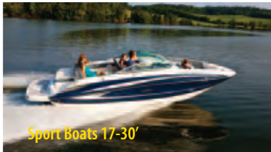
Sport Boats 17-30'