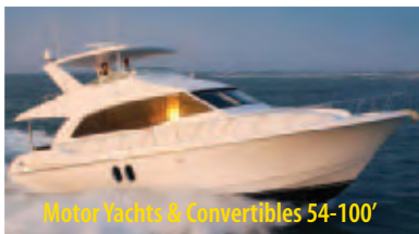
Motor Yachts & Convertibles 54-100'